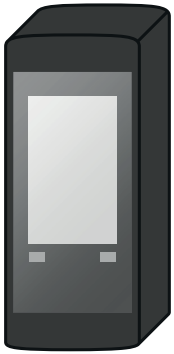
Tensor ST Controller