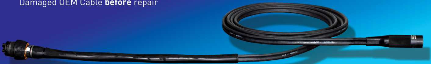
Cable Type: Atlas Copco Tensor STR, Part Number: 4220 4375 05