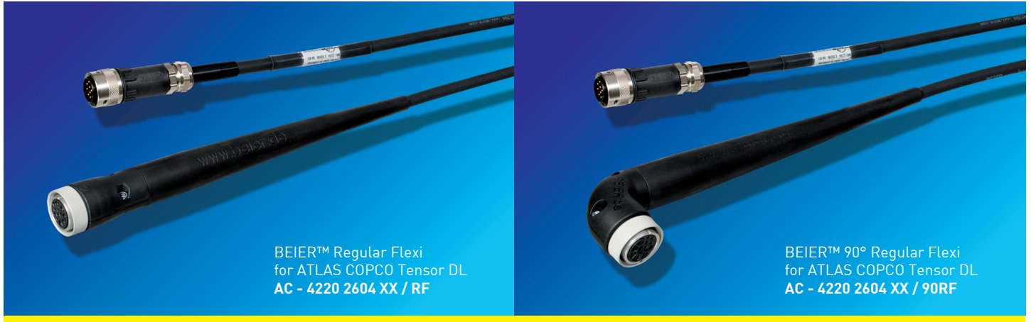
BEIER™ Regular Flexi for ATLAS COPCO Tensor DL AC - 4220 2604 XX / RF